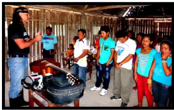
Indian Dedication To God

We took many Bibles in this time where some of these communities had none at all. We also took in some medicines which get dished out very quickly as the need is great. We shared God's Word and ministered Gospel music with guitar. Many Indians come to know JESUS as their Saviour for the first time and others were strengthened after a long time as the Word of God rarely gets to these isolated areas. It is with these trips that I get 1. HEALED from illnesses and that God 2. SPEAKS to me clearer than anywhere else. Why? The answer follows in this following Bible paragraph.