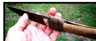
Hand Made Knife