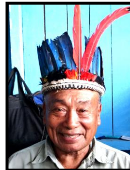
Huni Kuin Tribe