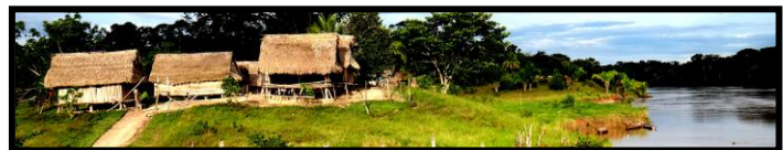
Huts And Canoes On The Right In The River Port

FIGHTING FOR THE LOST AS HE DIED FOR US ON THE CROSS !