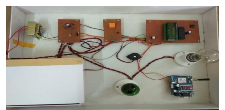
Fig.3: Hardware implementation of the system VI. CONCLUSION

The proposed system sends instant alert to the authorized power supplier when there is any kind of meter tampering detection. This system model would reduce the manual manipulation work and electricity theft. Use of GSM modem in this system provides an added advantage of wireless communication. The use of IR sensor in place of mechanical liver system, vibrational sensor or magnetic sensor is definitely a new approach to reduce the complexity and cost of the system. This system will help the government to reduce electricity theft and thereby increasing their revenue and power quality of the grid. The manufacturer cost is marginally greater than the existing system but when it will be implemented commercially then the cost will reduce significantly by two to three times.