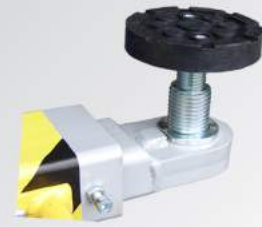
Low Profile 'Double Telescoping' Screw Pads