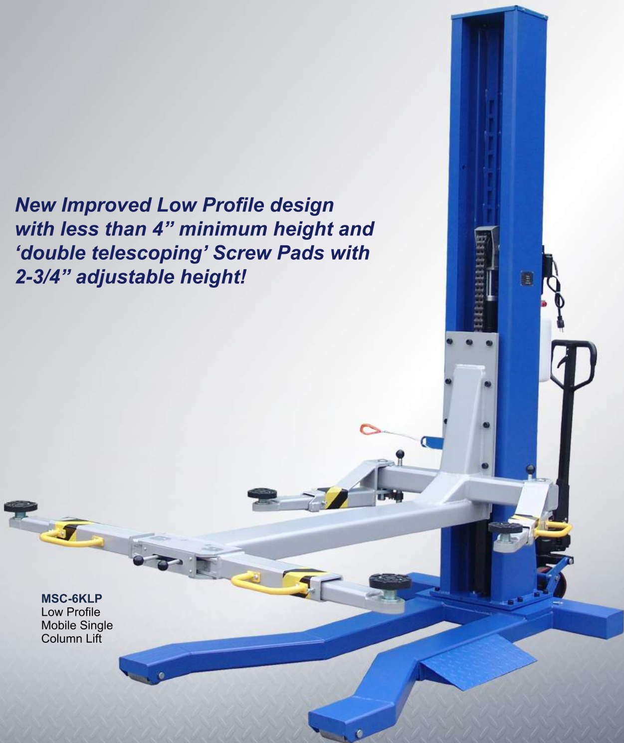
MSC-6KLP Low Profile Mobile Single Column Lift

New Improved Low Profile design with less than 4" minimum height and 'double telescoping' Screw Pads with 2-3/4" adjustable height!