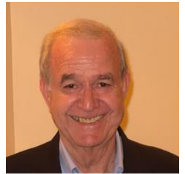
Truman Childress Scholarship Committee