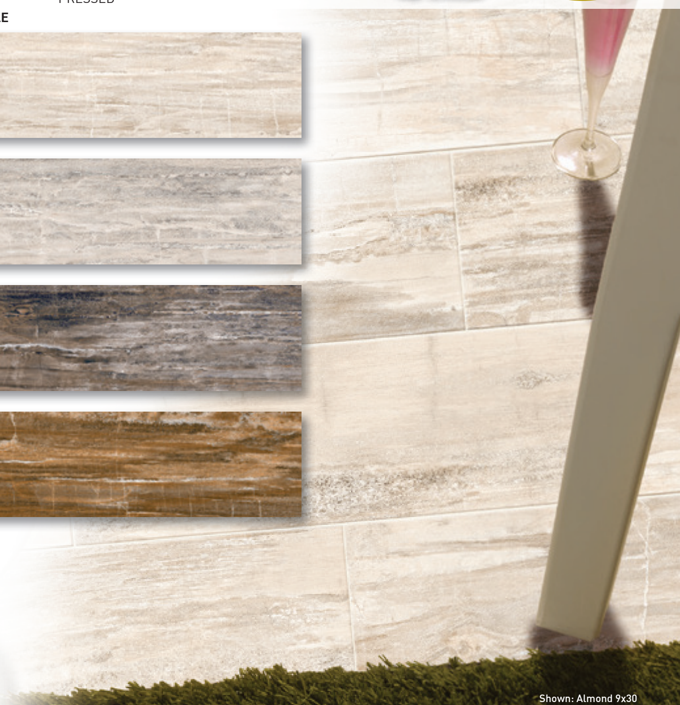
Shown: Almond 9x30