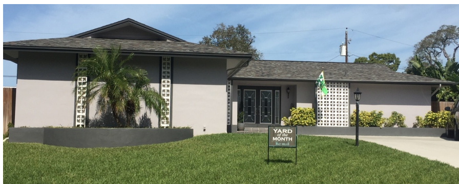
March Yard of the Month on Tanglewood

ITEMS NOT ALLOWED —roofing materials, hazardous materials, tires, car parts