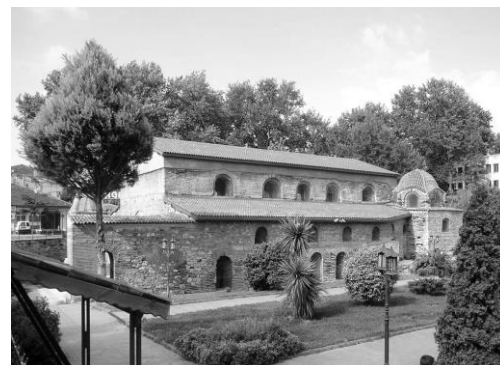
Hagia Sophia of Nicaea

of Antioch, St. Nicholas of Myra (yes, that one!), Eusebius of Caesarea (known as the first historian of the Church), Marcus of Calabria from Italia, Nicasius of Die from Gaul (modern-day France), and confessors such as Paphnutius of Thebes and Paul of Neocaesarea who still bore the marks of their persecutions and the great defender of the faith, St. Athanasius, a young deacon at the time.