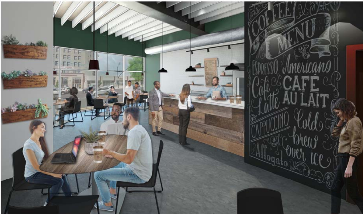
DOWNTOWN HAZELTON ALLIANCE for PROGRESS 13-15 WEST BROAD STREET WEST HAZELTON, PA

A 600 square foot café or other retail space will occupy the front of the building, which will be independent of the LaunchBox but connected internally to the co-working space at Penn State’s discretion. This retail space will provide entrepreneurs with the opportunity to start and grow their business by selling items within a street-level storefront location.