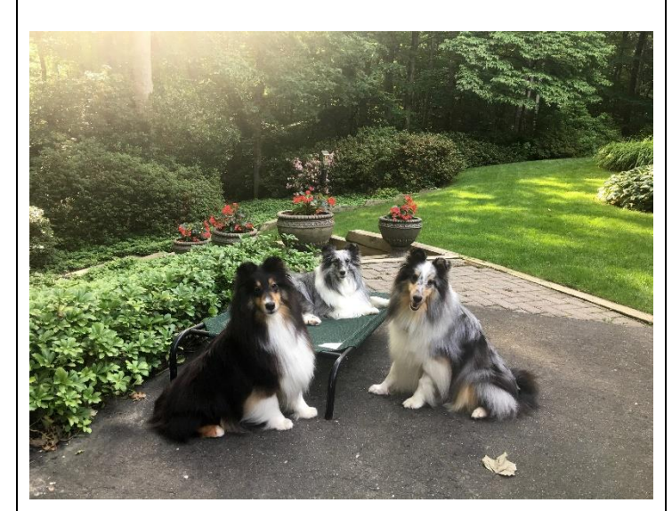
The Green Shelties: Tobin, Sawyer & Pilot enjoy their yard.