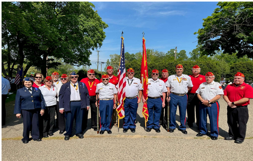
Clinton Grove cemetery, 5/28/2023

The next General Membership Meeting will be held on Thursday July 6th at 7:30 (our usual time.) Join us at the American Legion, Post 351, 46146 Cass Avenue located in Utica, always on the first Thursday of the month. The telephone number to the Post is (586) 731-9833.