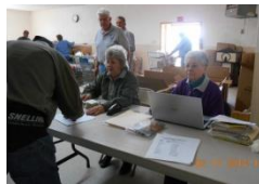
In the Rio Abajo community, St. Vincent de Paul

People can help Roadrunner secure food to feed hungry New Mexicans by making a monetary contribution at www.rafb.org or by texting any dollar amount to 505-933-7732. For every $1, five meals are distributed to communities across the state.