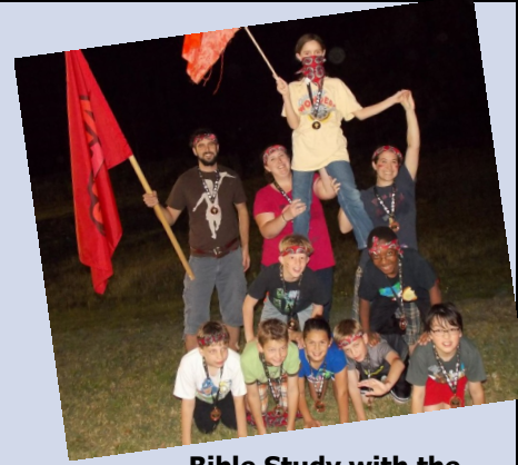
Bible Study with the neighborhood kids