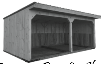
Economy Run-In Sheds