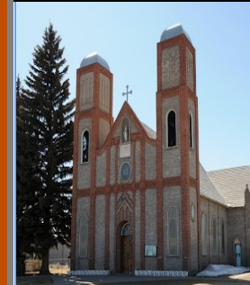
Our Lady of Guadalupe Parish Oldest Parish in Colorado Established in 1858