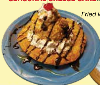
Fried ice cream