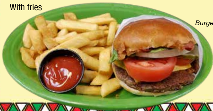
Burger and fries