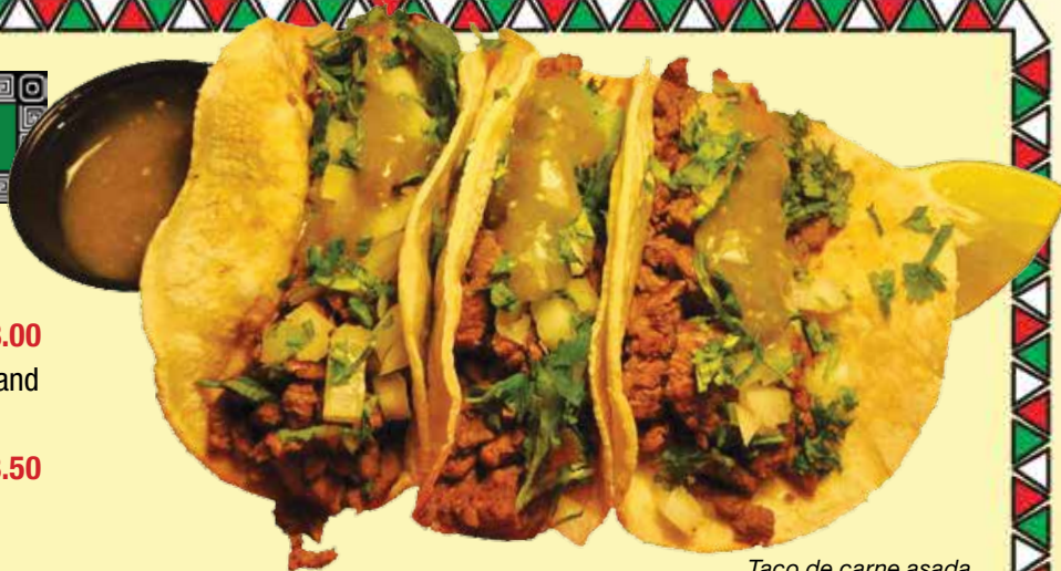
Taco de carne asada