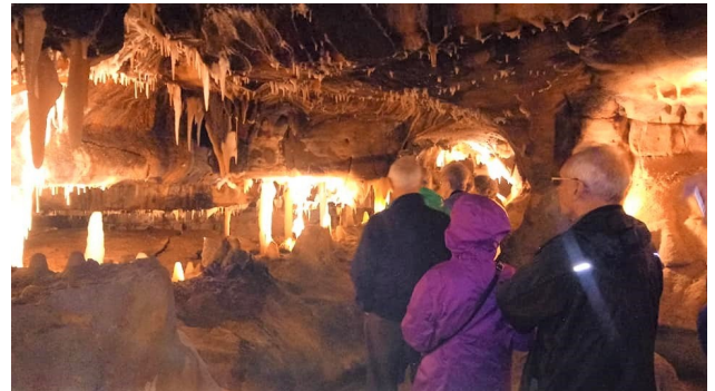
It was beautiful inside the cavern. We had a really good guide. The history of how it was discovered and the work that was done to make it accessible is very interesting.