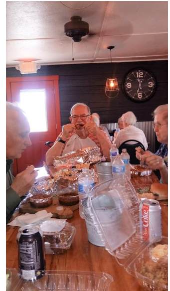
Chowing down on Ribs and BBQ at Uncle Beth's! So good!!