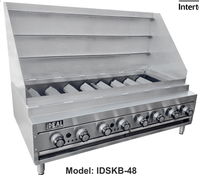
Model: IDSKB-48 (w/ Optional Skewer Level Racks)