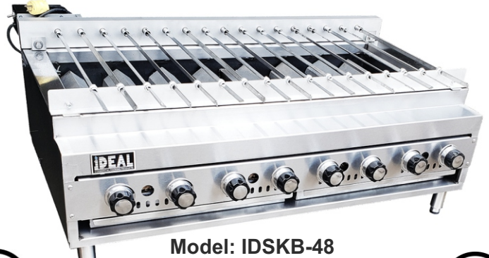
Model: IDSKB-48 (Shown with optional Rotisserie)