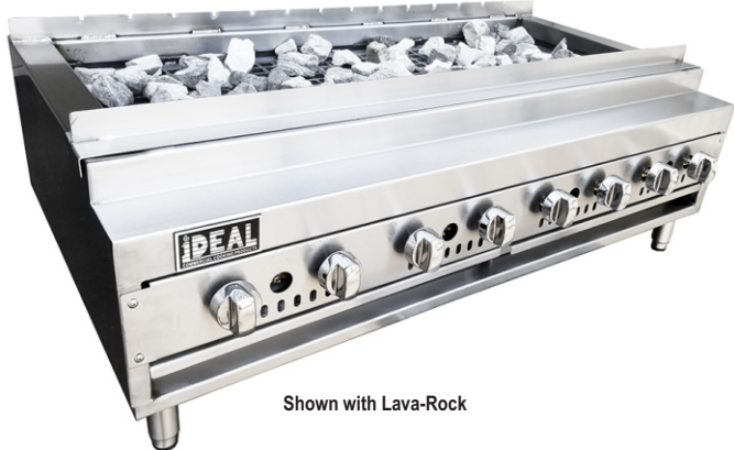
Shown with Lava-Rock

Gas: 3/4" NPT rear gas connection, specify type of gas and altitude if over 2,000 feet. Pressure: 5" W.C. - Natural Gas 10" W.C. - Propane Gas Note: Install the pressure regulator supplied with the appliance at the inlet of the gas line.