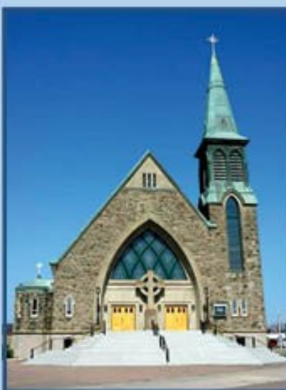
Saint Augustine's Moncton