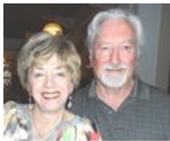
See you soon.