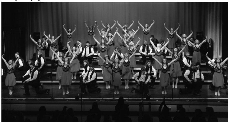
Hastings Riverside – Grand Champions of COE 2016.

to satisfy everyone's sweet tooth. Parent volunteers staff a Hospitality room to give bus drivers a place to relax while their groups compete.