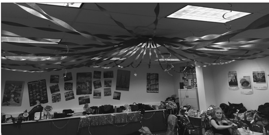
Westside show choir students decorated classrooms for each visiting choir.