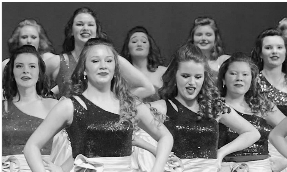
Simply Irresistible performing at Ramageddon 2016 at Ralson High School.

Westside's all-female show choir has been simply irresistible for 15 years! This year is no exception. Recently, judges in Kansas City and in Ralston were "unable to resist" awarding the group the title of Women's Division Grand Champions . In each event, Sim-