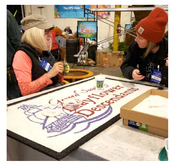
Volunteers spent hours applying seeds, flowers and other organic materials to create the floats and signage in the Rose Bowl Parade.