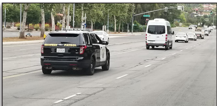
California highway Patrol escorting the riders out of the Start-Finish area.