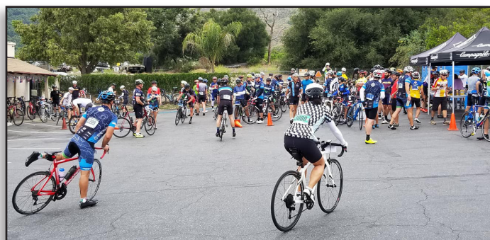
Another rest area along the course.