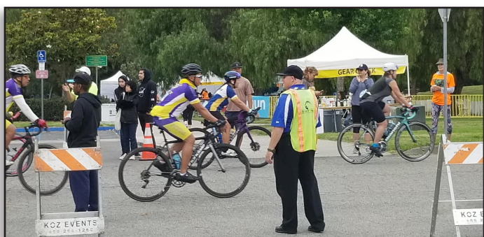
One of the rest areas along the course.