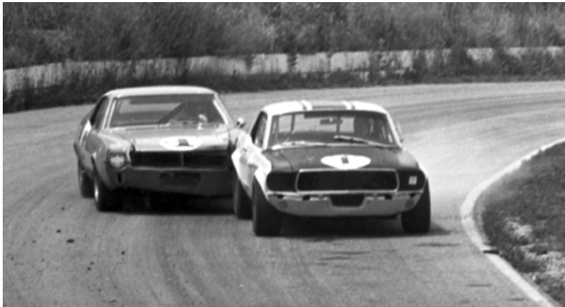
Jerry Titus’ Mustang leading George Follmer’s Javelin at Meadowdale.