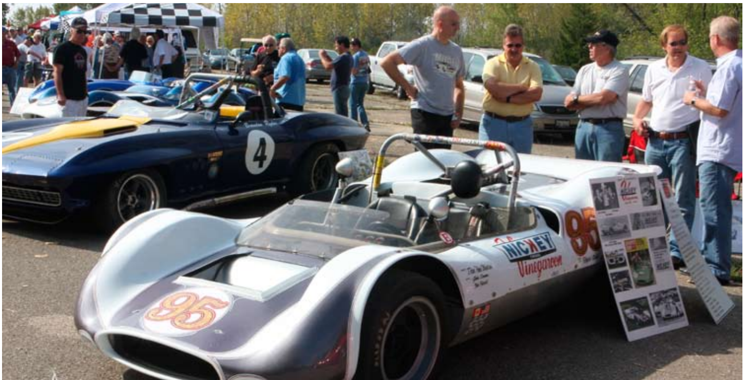
Road Racing Cars like the Genie MK10B "Vinegaroon" (above) were featured at the 2009 Meadowdale Motorsports & Memories Car Show.