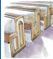
News from the Pews