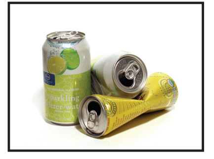
BEVERAGE CANS Please rinse.