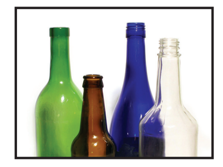
Rinse and remove caps. All colors can be mixed. Labels need not be removed.