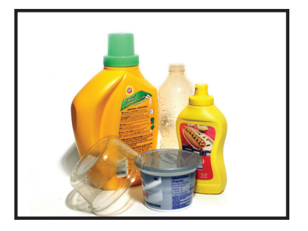
#1-#7 PLASTICS Plastic bottles, such as milk jugs, pop bottles, shampoo and detergent bottles. Clamshells and containers such as those used for salad, cottage cheese, yogurt, and berries. No Styrofoam.