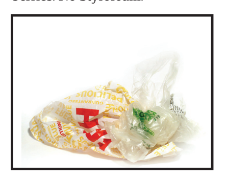
FILM PLASTIC Number 2 & number 4 film plastics, such as bubble wrap, shrink wrap, bread bags, grocery bags, & sandwich bags. All film plastic must be stuffed inside one clear plastic bag. MIXED PAPE Letterhead paper, non envelopes.