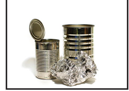
TIN/STEEL CANS & ALUMINUM SCRAP Pet food cans, fruit and vegetable cans, etc. Aluminum foil, pie pans and other small scrap. Material must be free of food. Labels need not be removed.