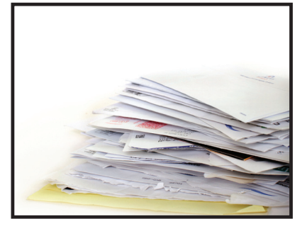
MIXED PAPER (NON-GLOSSY) Letterhead, copy paper, colored paper, non-glossy junk mail, envelopes.