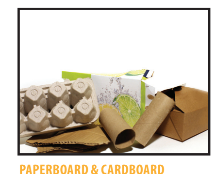
Cereal boxes, cracker boxes, pop & beer cartons, paper towel rolls, paper egg cartons, etc. Brown corrugated, paper grocery sacks, brown/manila envelopes. Remove plastic inserts and flatten.