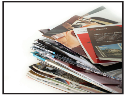
MAGAZINES & CATALOGS Glossy paper, glossy junk mail.