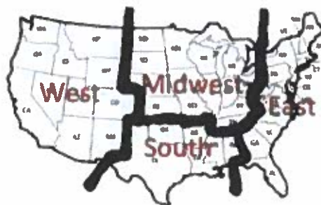
Regional Futurity Map

14. Premiums: A Minimum of $3000 will be awarded and divided among the top regional exhibitors. There will be 4 regional areas receive awards. You may only be eligible for awards within the region you reside. (See regional map below). Points may be obtained at shows outside your region but they can only be applied to the national overall award. You may not be eligible in two regions for awards. All futurity ewe lamb exhibitors are eligible for the overall national winner. The guaranteed monetary amounts are as follows: Regional awards First Place - $300; Second Place $200; Third Place - $100; Fourth Place - $100. National Champion $200 Bonus.