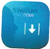
Swallow Now $2.99 Get drooling under control with a timer