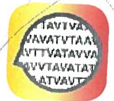
Visual Attention TherAppy Free Trial, $9.99 For left sided neglect