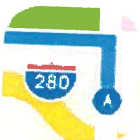
Maps Get directions, see where you are, and discuss places