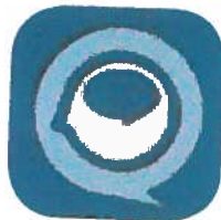
Conversation TherAppy Free Trial, $24.99 High-level language