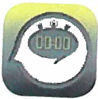
Spaced Retrieval TherAppy $3.99 Memory training timer for SR