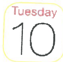
Calendar Schedule reminders for appointments