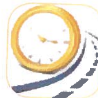
Speech Pacesetter Free Trial, $8.99 Train speech rate