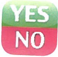
Answers Yes No Free Trial, $1.99 Two choice communication aide