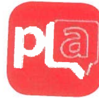
Predictable $159.99 Type or use stored message