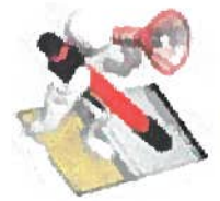
HandySpeech Free Trial, $29.99 Converts handwriting to text & speech