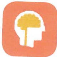
Lumosity Free w/ IAP General brain training exercises