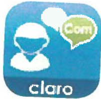
ClaroCom USA Free w/ IAP Select pre-typed message to speak