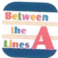
Between the Lines Advanced $1 Trial, $15.99 Train pragmatic skills