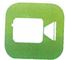
FaceTime Use of video lets body language assist communication