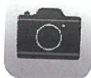
Camera Take photos & videos to enhance communication & memory