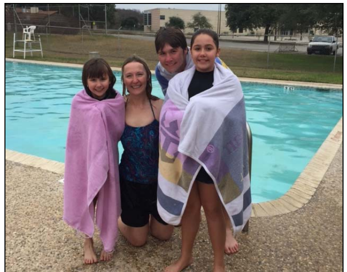
The Polar Bear Plunge is fun for kids and all!

Continuing with the theme of events offered to the RR community, we will have had the New Year's Day Polar Bear Plunge by the time you are reading this. This event is now also becoming quite the social go-to event and attendance keeps growing. What a better way to start the New Year than with good food and good company.