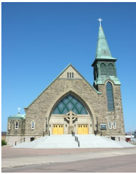
Saint Augustine's 340 Dominion Street Moncton, NB

October 1, 2017 Twenty-Sixth Sunday in Ordinary Time