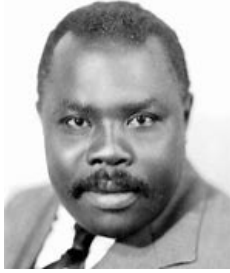
Marcus Mosiah Garvey