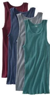
Marina ribbed undershirt

It is because of these situations that Sanda Marina, the Intermittent/Interloper Devel who came to know about their existence, as she goes into their brain and body to search. Every man, penis one is to wear a “Marina” undershirt under their shirt to protect them against the Sanda Marina devel. The Marina undershirt has protection in it especially for the male types. The marina has a ribbed stretchable material that is not elastic. The marina is not to be white, green or cream color. It should be black, red blue, etc. There is also a marina type brief underwear to protect the cocky and the batty from Sanda Marina as well.