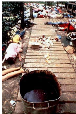
Bodies of members of the Peoples Temple who died after their leader Jim Jones ordered them to drink a cyanide-laced beverage. The metal wash pan contained the poison that they drank.

Jim Jones and hundreds of his followers emigrated to Guyana, West Indies, and set up an agricultural community called Jonestown in 1977. Jones became like a dictator and confiscated passports and millions of dollars from his followers, and manipulated his followers with threats of blackmail, beatings, and probable death. He also staged bizarre rehearsals for a ritual mass suicide. On November 18 he commanded his followers to drink cyanide-adulterated punch, an order that the vast majority of them passively and inexplicably obeyed. Jones himself died of a possible self-inflicted gunshot wound in the head. Guyanese troops reached Jonestown the next day, and the death toll of cultists was eventually placed at 913, including 276 children.