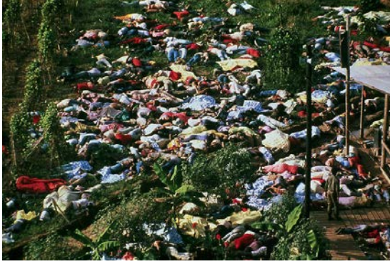
Dead bodies litter the ground after a mass suicide of the People's Temple cult followers.

It is reported that Jim Jones compared his beliefs and activities to the likes of Vladimir Lenin of Russia and Jesus Christ, the Barak Obama of unknown history. Mark Hatfield, Jim Jones, Marcus Garvey, Bill DeBlasio, and his other names can be of any color, any size, shape, and height. He can be Black or soft pink or brown or a mixture of brown and soft pink in color, and he can also be Indian looking and short, tall, stocky sometimes thin looking. The most you will see him looking is a thick tough, hog head looking man with very round toe shoes. He likes to be tall and he can seem intelligent as he has many of our lives in him and he uses dead PhDs thinking and speech boxes to make himself seen as intellectual and charismatic to draw interest. Whenever he is thin looking he gives his wife or one of his other forms the many chreations he uses inside of him as power and energy. Mark Hatfield and his wife transfer between thickness as he can appear thicker some days and thinner some days. They have many of the Inerlopeans esistences in them and many chreations and other esistences they have stolen.