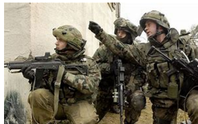
US Military in Action

Outside these Earths are Kingdums I have Chreated. This Earth is not a Planet and the other Esistences they call Mars, Pluto, Venus, Saturn, Mercury, Jupiter, Saturn, Uranium, Neptune and others are not Planets. They are Kingdums, and they are both Natural, Real, and other Forms similar to this Earth. The Military, Army and other types of them including the Air Force they go into these esitences that I have chreated to do many experiments and to terror and torch them. They use these arms and many entrapments and other apparatus they specialize in, to connect to the Kingdums and to go where they are not to go. They have a nit string computerized accessory that they use to connect to anything and it is estremely difficult to get away from them, as they nit or latch on to you or to anything, and they keep a string of the connection that they continue to connect to you. They use this apparatus on you and used your body to do wicked things you are not in control of. The police then arrest you and say that you are the cause of disruption and chaos when you do not know that the police and the military are working together, so they have