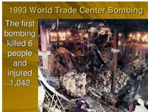
World Trade Center first bombing on February 26, 1993