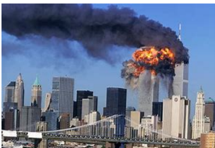
World Trade Center bombings on September 11, 2001