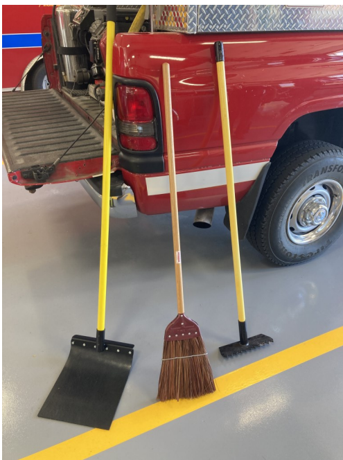
Left Photo-(Grant Items)-Brooms, Rakes, Swatters Right Photo-Radios with Chargers Below-2 New LP 15 Monitors