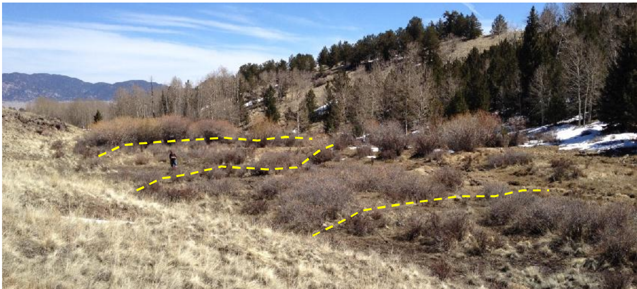
Figure 3: The single thread channel of Pruden Creek is visible on the right side of the image running through a historically active floodplain. Relic beaver dams are identified by the dashed lines.

Pruden and Cross Creeks offer good potential for restoration of wetland functions by reintroducing beavers. About 8900 ft of the Pruden Creek drainage and 4500 ft on Cross Creek have good or excellent habitat suitability for beavers. From these suitable reaches, we identified two priority sites on Pruden Creek (about 1900 ft) and one site on Cross Creek (about 700 ft) where beaver reintroduction is predicted to result in the restoration of about 2.5 and 0.9 acres worth of wetland functional units, respectively. (These are the blue segments in Figure 1). Figure 3 is a photo of the selected Middle Pruden Creek restoration site taken in September of 2014.