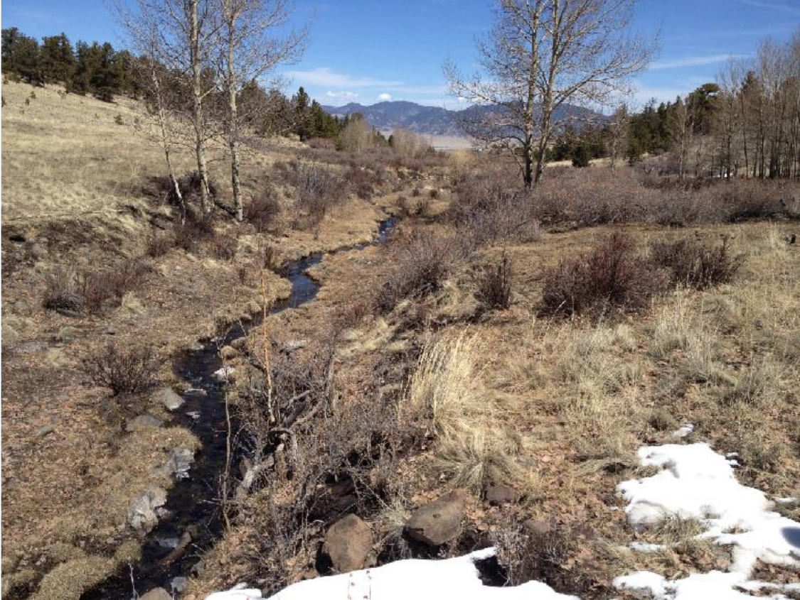
Figure 2: On artificially channelized reaches, the stream is entrenched and dissociated from its historic floodplain. Deeply entrenched segments such as this have limited wetland restoration potential as bank heights exceed the height of typical stable beaver dams.