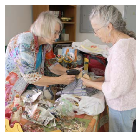
Preparing for the Fall Festival