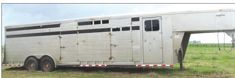
1999 Sooner 6 1/2' x 28' Stock - combo aluminum trailer, 2 center gates with sliders, 2 escape doors, 4 ft. tack room. Good condition.