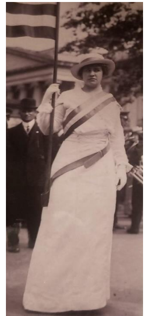
Suffragette - 1920