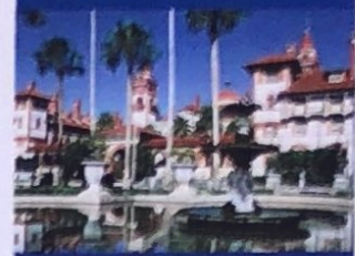
St. Augustine, our Nation's Oldest City