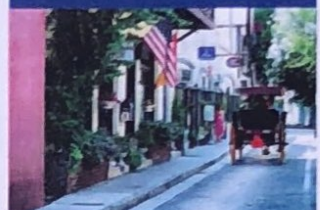
Historic St. George St