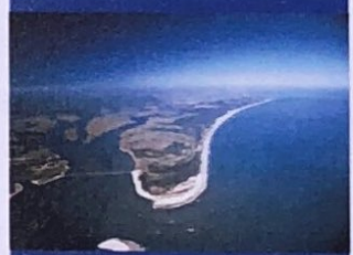
Aerial view of Amelia Island

Departure: Hastings, NE @ 8 am, then Fairbury, NE @ 10:30 am