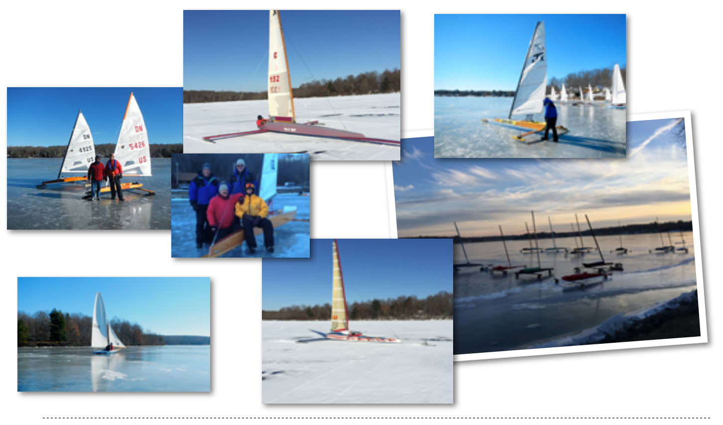
DON'T FORGET THE CLUB MEETING - REPORTS, THOUGHTS, QUESTIONS & SUGGESTIONS