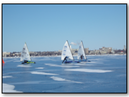
All loaded and ready to head out to the course and the gold fleet start