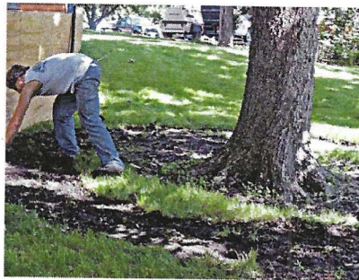
The first step is to remove a circle of turf grass around the tree. The size of the ring will depend on the size of the tree, the soil conditions, and the objective of the treatment.