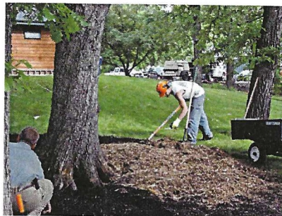
A layer of organic mulch is then added to the surface. Mulch will help with everything from retaining soil moisture to improving the biological and chemical makeup of the soil to promote tree roots.