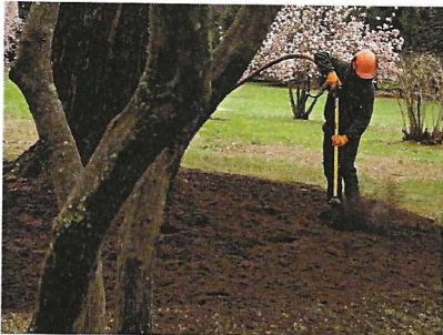
Depending on the treatment, organic matter may be added to the existing soil and incorporated in using the AIR-SPADE. This can greatly improve the quality of the soil for root growth.