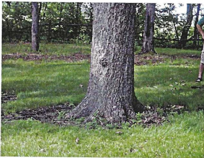
This mature oak tree is a good candidate for a root enhancement treatment. Its root system could be improved by the removal of competing turf grass, soil aeration, and addition of mulch.