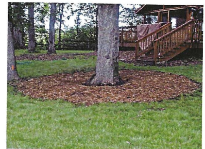
The finished treatment. This oak tree's roots are now in an improved environment and will benefit from the increased aeration and biological activity for years to come.