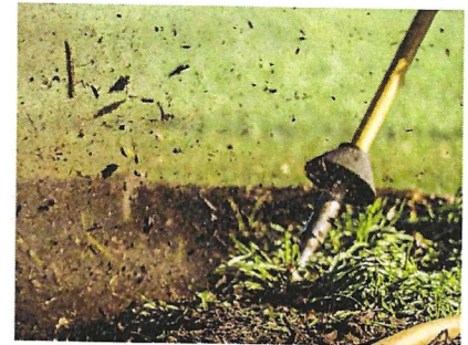
Using the AIR-SPADE tool, the soil will be churned and aerated to alleviate compaction and increase the suitable habitat for healthy root growth.