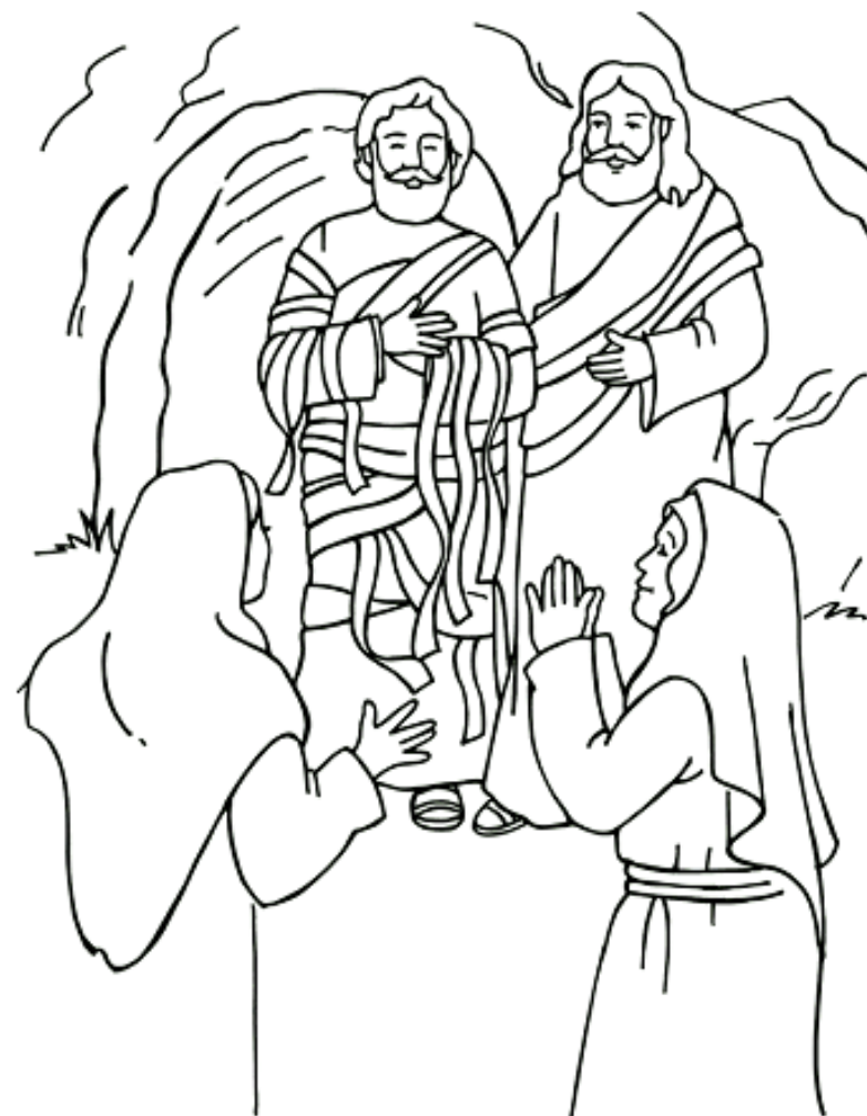
Jesus Raises Lazarus

Image from Thru-the-Bible Coloring Pages for Ages 4-8. © Standard Publishing. Used by permission. Reproducible Coloring Books may be purchased from Standard Publishing, www.standardpub.com , 1-800-543-1301.