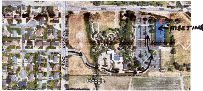
Our meeting will be held in the rear building Board Room. Park in rear parking lot.

February 15, 2018 7:00 pm Conservation Garden Park 8275 South 1300 West West Jordan Speaker: Cindy Bee Topic: Utah Perennials Meal Provided No Adult Beverages Wheelchair Accessible