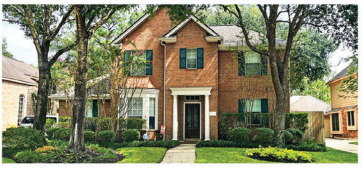
Section 2 | 9115 Rhapsody Lane