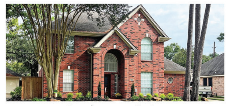
Section 1 | 9206 Symphonic Lane