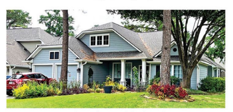
Section 4 | 9315 Sinfonia Drive