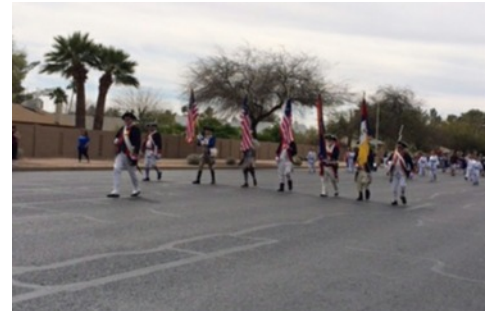
Marching all in step. Received a 21 inch trophy for second place as a marching Color Guard