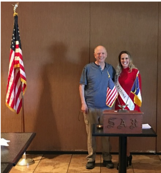
Miss Arizona read a poem she had written for Veterans