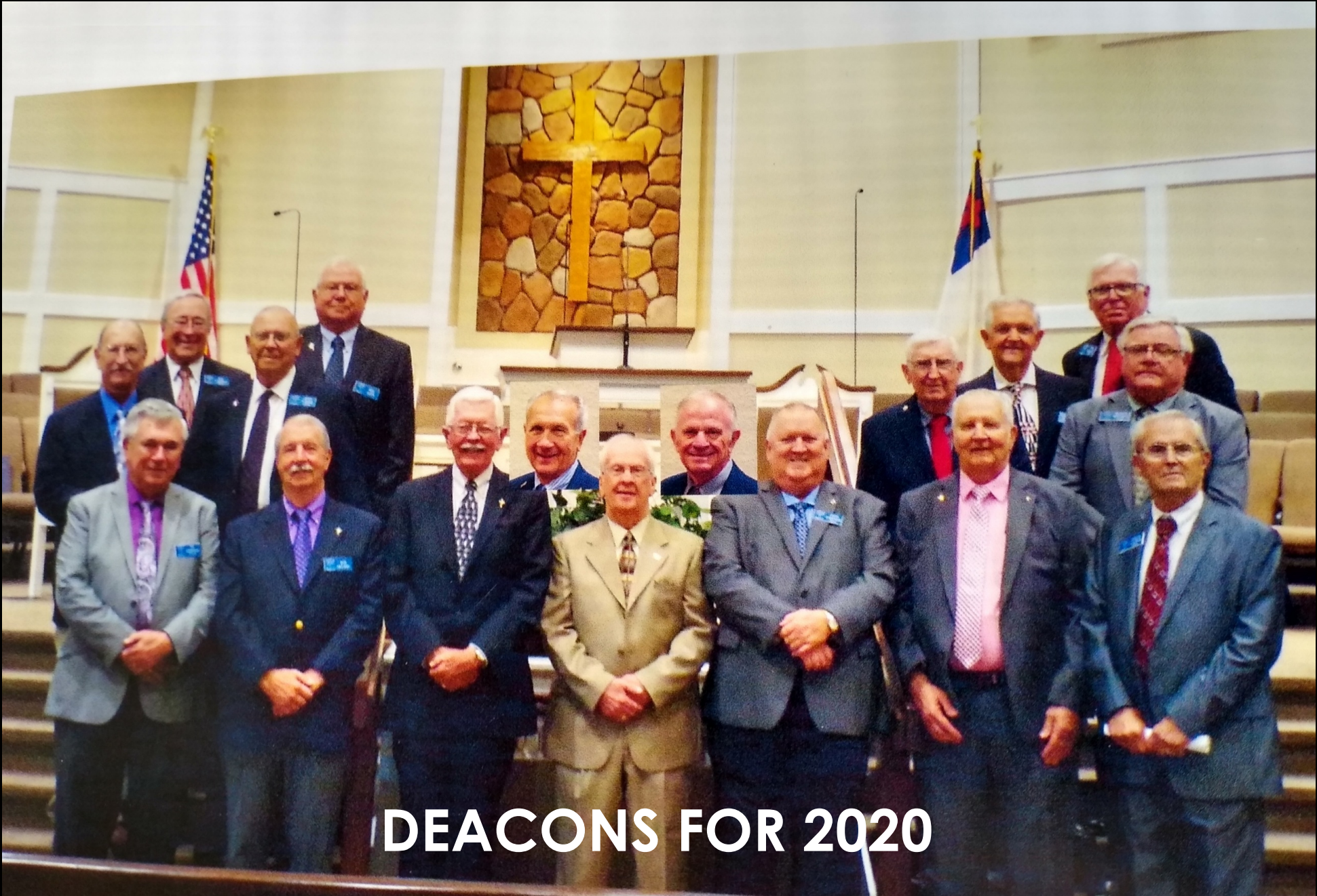
DEACONS FOR 2020