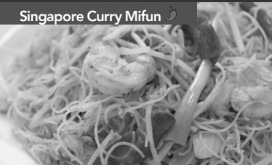
Singapore Curry Mifun