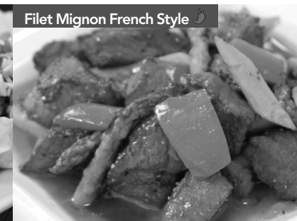
Filet Mignon French Style 🍷