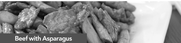
Beef with Asparagus

Chicken breast with fresh white mushrooms and snow peas stir-fried in a white wine sauce SM 9.49 • LG 12.99