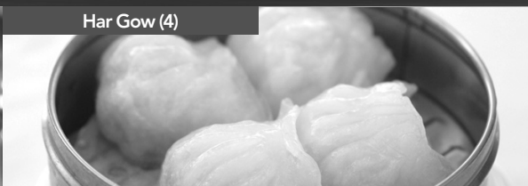
Har Gow (4)