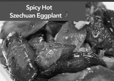
Spicy Hot Szechuan Eggplant 🍗

Fresh cut eggplant stir-fried with our spicy Szechuan sauce 11.99