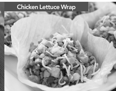
Chicken Lettuce Wrap