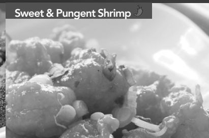
Sweet & Pungent Shrimp 🍗