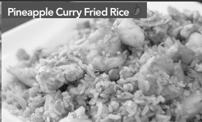
Pineapple Curry Fried Rice