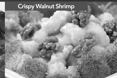
Crispy Walnut Shrimp