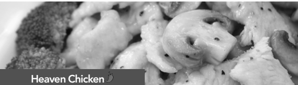
Heaven Chicken 🍗

Chicken breast, organic wild mushrooms, snow peas and carrots stir-fried in brown sauce 13.99