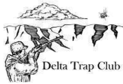
Delta Trap Club

P.O. Box 1061 8017 Trap Club Road Delta, Colorado 81416 (970) 874-7424