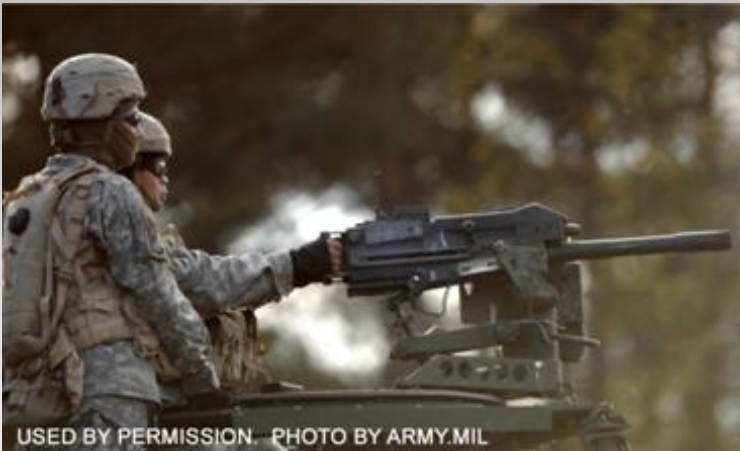
USED BY PERMISSION. PHOTO BY ARMY.MIL

AMTEC continues to exceed requirements for quality and reliability for 40mm Grenade Production.