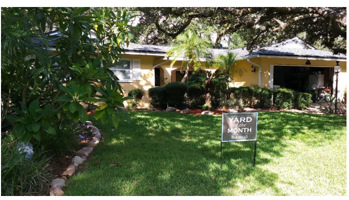
August Yard of the Month on Maplewood