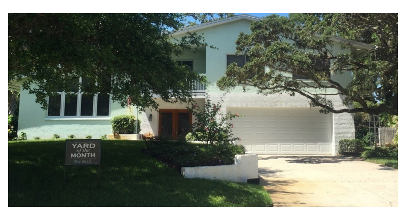
July Yard of the Month on Hillview