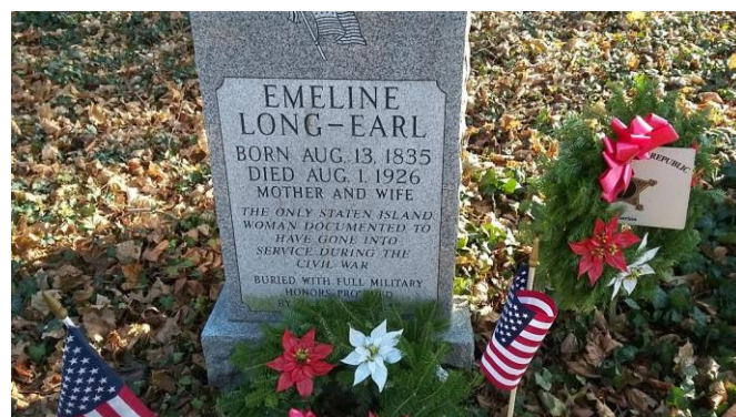
Emeline Long-Earl only woman on Staten Island to serve in the Civil War is buried here at Lake Cemetery.