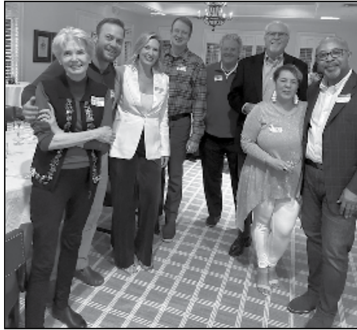
Kanawha Community Association held their Annual Holiday Party at Smoke Rise Country Club on December 13th.

Just reading this community newspaper is a form of being connected. If any of our readers want to get more involved, let one of the staff members know of your interest. They are listed on page 2. If you like to write, edit, take pictures, or volunteer in some other way, get in touch. It is good for your mental and physical health and wonderful for our community. Connect!