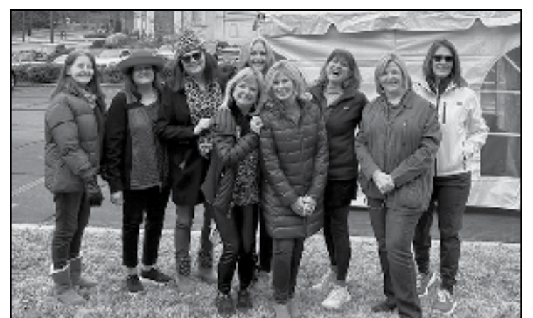
Mountain Mums Walk to Remember...again.