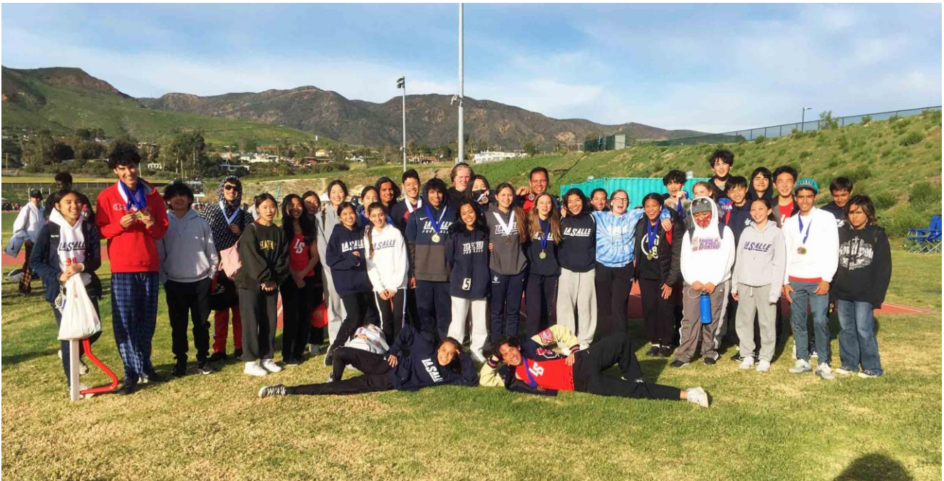
Some of our 80 team members last year at the Malibu Invitational!