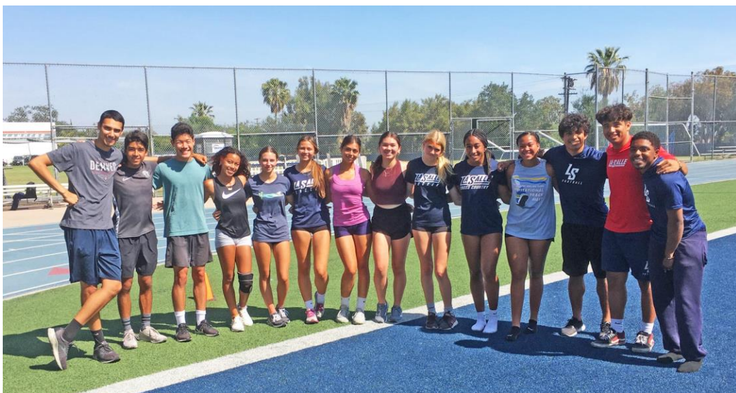
Some of our 23 team members last year who qualified for CIF!